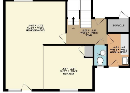
GROUND FLOOR 65.5 sq.m. (688 sq.ft.) approx.

Shires Residential 4 New Street, Mildenhall, Suffolk, IP28 7EN T: 01638 712132 E: mildenhall@shiresstatagents.co.uk www.shiresresidential.com