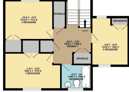
1ST FLOOR 65.4 sq.m. (697 sq.ft.) approx.

Which energy rating has been made to ensure the accuracy of the energy consumed, measurement of doors, windows, rooms and any other items are appropriate and no responsibility is taken for any errors or omissions on the document. The data for building purposes only and should not be used for any prospective purchaser. The services, systems and appliances shown have not been tested and no guarantee is made with respect to energy or energy saving costs. TOTAL FLOOR AREA - 111.0 sq.m. (1195 sq.ft.) approx.